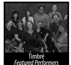
Timbré Featured Performers

For registration information and more details about the 2018 Area 8 Festival and YouthFest, please visit http://areaviii.org .