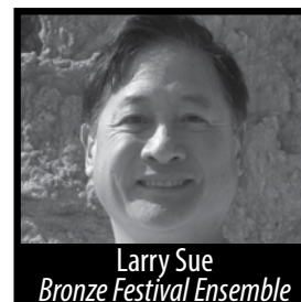
Larry Sue Bronze Festival Ensemble